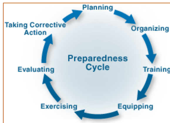
Figure 2: The RDPO's preparedness cycle is reflected above.